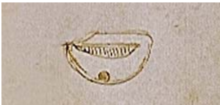
Picture 2. Details from a draft of gravity machine of da Vinci

By further analysis and comparison we found multiple improvements – trough friction decrease and “harnessed” gravitation.