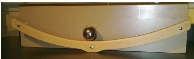
Picture 3. Copy of details, with alternate rolling of a ball which lasted 22 seconds