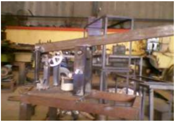
Fig 4.1 Experimental Set Up

Electricity generated through oscillatory motion. Initially manually force applied on pendulum bar which is connected on one end of the upper arm. The pendulum bar moves left to right or right to left in an oscillatory motion. When pendulum moves towards left side the upper arm moves downward direction with the help of hinge pin, which is provided between upper arm and lower arm. But when upper arm moves in downward direction the other end of upper arm rack and pinion arrangement provided. The rack moves in downward direction on pinion. The rack and pinion shaft connected to the worn gear which is mounted on same shaft. The rack and pinion gives the motion to worn gear and the worn gear mesh with dynamometer shaft and electricity generated.